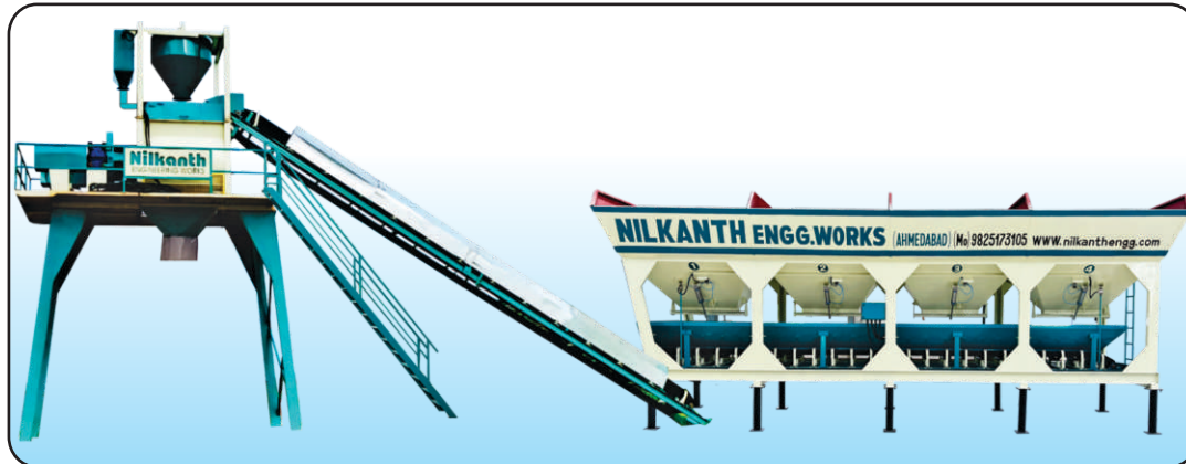
Stationary Concrete Batching Plant Inline - Twinshaft Mixer Cap. 45,60,75,90,120 Cu.M/Hr