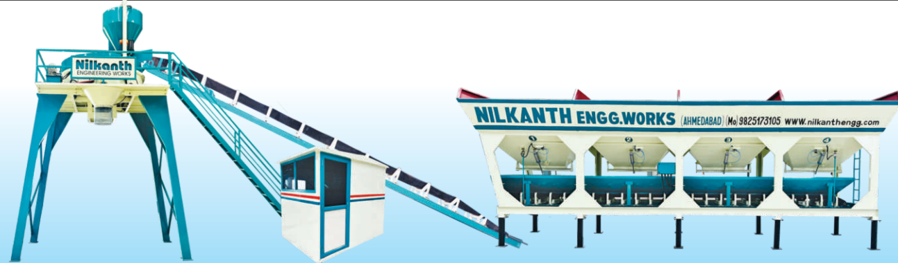
Stationary Concrete Batching Plant - Pan Mixer Cap. 30,45,60 Cu.M/Hr