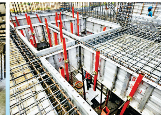
Aluminium Formwork Acessories