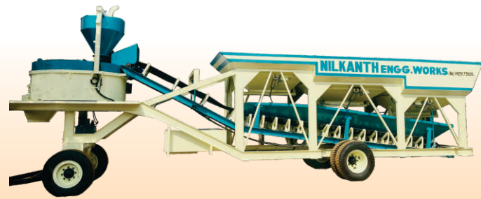
Mobile/Compact Concrete Batching Plant - 3 BIN Cap.30,45,60 Cu.M/Hr