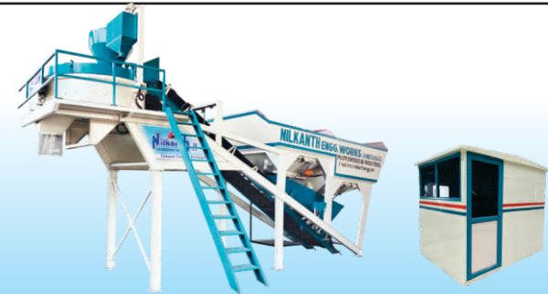
Compact Concrete Batching Plant - Cross Bin Cap.30,45,60 Cu.M/Hr