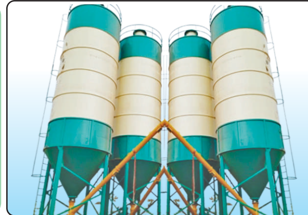
Cement & Flyash Storage Silo Cap.100,120,150,200 TON