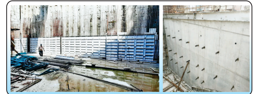
Share Wall Formwork